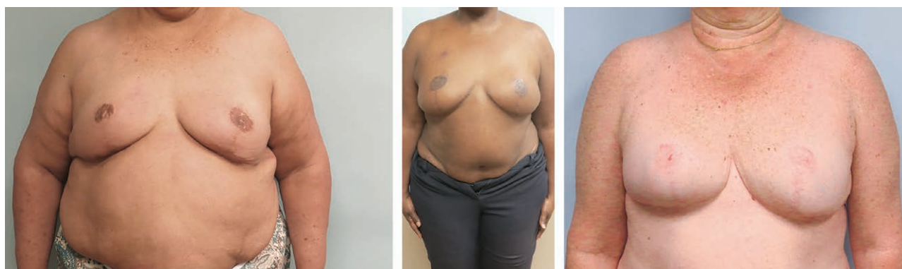
Fig. 5. More than 1 year postoperative following second-stage subpectoral implant placement in all 3 patients. The last patient underwent just right implant placement with improvement of her asymmetry.